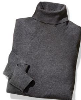
POLO RALPH LAUREN

Smart and sophisticated, the turtleneck is the peak of refinement. Wear it with jeans for instant polish or under a tailored jacket to make a tie-free statement.