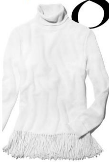
8 Sonix iPhone 7 Case

If you're going to get caught snapping a selfie, you need a statement smartphone case.