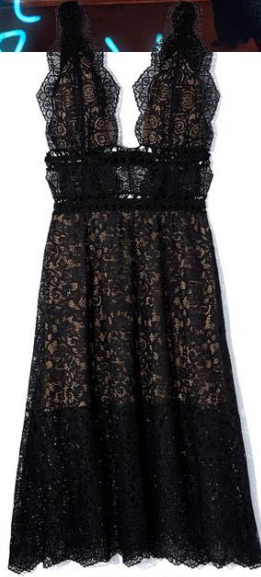
FOR LOVE & LEMONS

Whether in jet black or winter whites, the megawatt overlay makes the season merry and light on cocktail-party-ready LBDs, matching sets and slinky slip dresses.