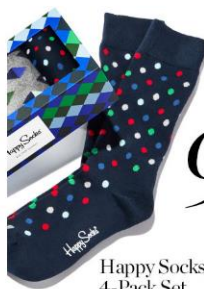
9 Happy Socks 4-Pack Set