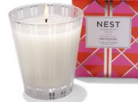
10 NEST Fragrances Candle