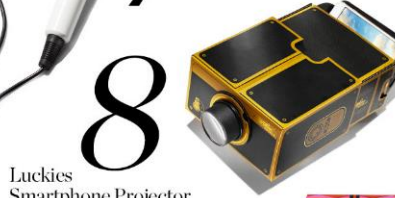
8 Luckies Smartphone Projector