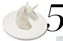
5 Berry Ring Dish